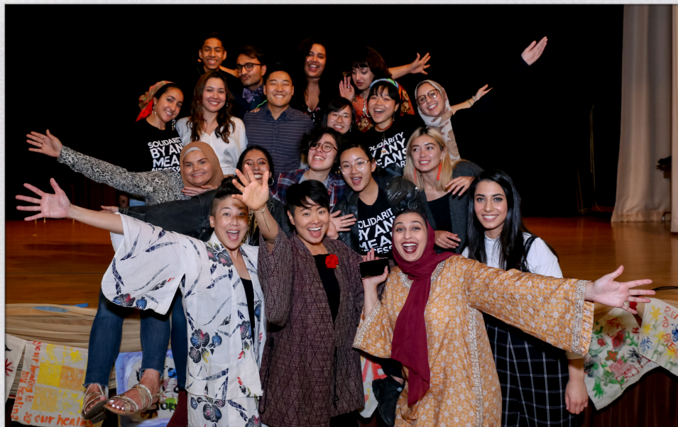
From our 2019 Iftar with our first cohort of Solidarity Arts Fellows!

With over 180 attendees, the 2020 #VigilantLOVE Bridging Communities virtual Iftar demonstrated that the spirited atmosphere of community solidarity that has characterized the Iftar since its beginning six years ago could be sustained online. This year, we have decided to host our Iftar online again for the safety and wellbeing of our communities. We hope you will join us!